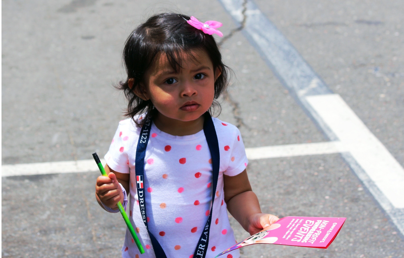
Young children can find story hours, reading preparation, and other learning readiness activities in the Leap Into Learning program.